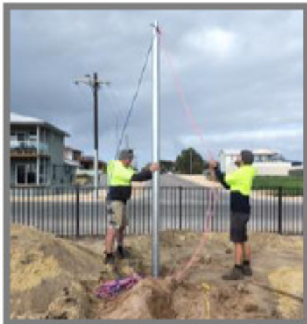
Workman putting up post.