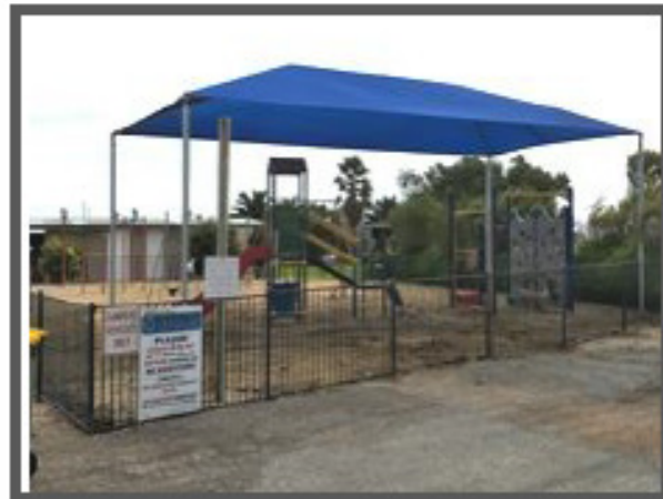
Final shade up